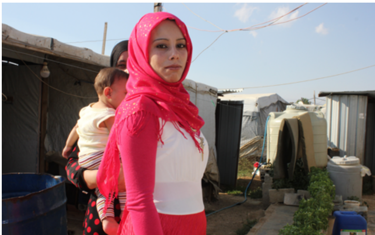
Syrian Refugee Camp Ghazze, Lebanon - 2018

TOTAL BENEFICIARIES IN 2018: 59,572 Individuals + 400 Families