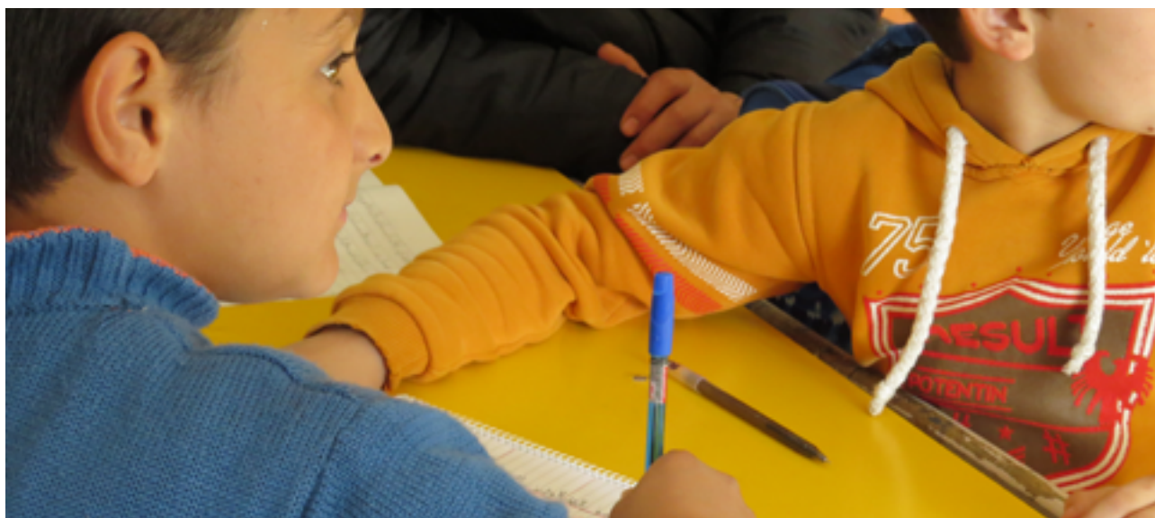
Syrian Refugee Children in Damma School, Ghazze, Lebanon - 2019