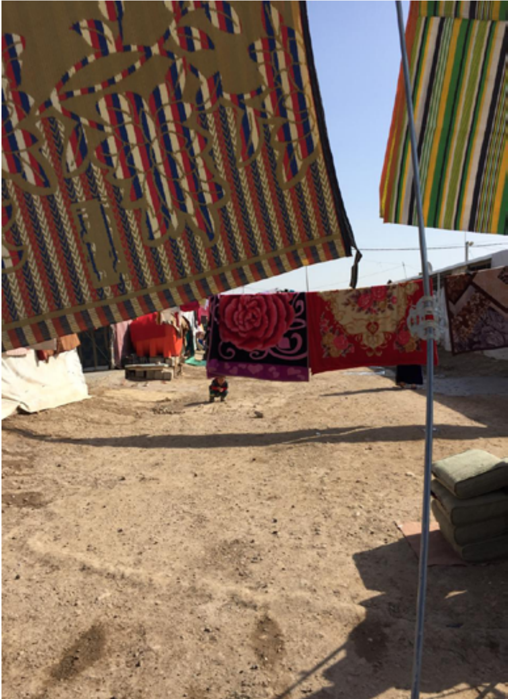
AlAhl Camp Iraq, January 2019